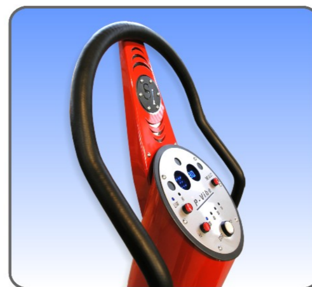
User Friendly Control Panel